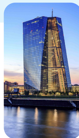
European Central Bank Frankfurt

Talks from company representatives such as from the real estate and automotive industry in Germany will complement the programme as well as a practical session run by the Career Service of AUAS on Applying for Internships/Jobs in Germany (in English).