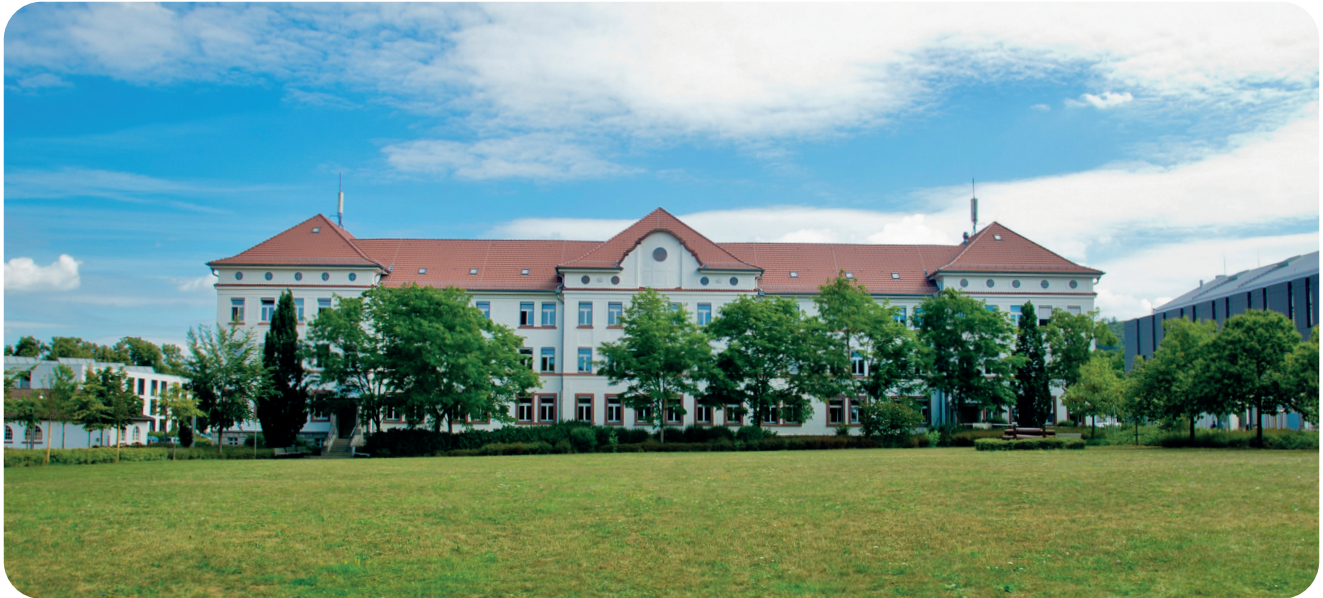
Our campus and building 20, Faculty of Business and Law