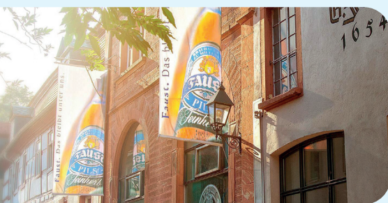
Brewery tour Miltenberg