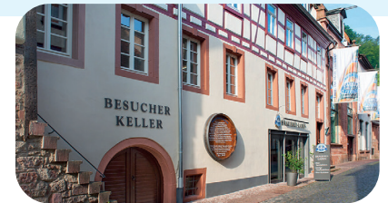
Brewery tour Miltenberg

And many more local activities like visiting our "Volksfest" (fun fair) in Aschaffenburg and our local (urban) vineyard and winery "Urbani".